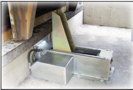
Hold-Tite® can be drive mounted or wall mounted.