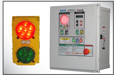
iDock Controls includes light communication and can be integrated with other dock equipment.